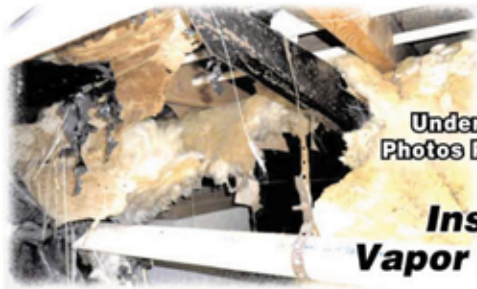
Underhome Photos Provided

Insulation Under Your Home Falling Down? Holes and Tears in Your Vapor /Moisture Barrier?